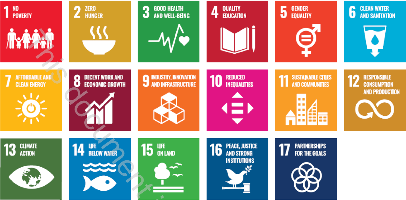
Figure 3 — The icons of the United Nations Sustainable Development Goals (SDG)