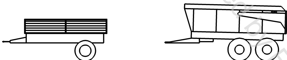
Figure 2 — Examples of semi-mounted trailer